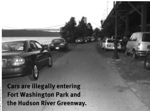
Cars are illegally entering Fort Washington Park and the Hudson River Greenway.

F ort Washington Park and the northern portion of the Hudson River Greenway on Manhattan's west side are under siege from illegal motor vehicle traffic. The metal gate that leads to the biking and walking path at 158th Street, beneath Henry Hudson Parkway, was badly damaged this summer