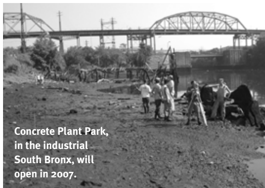
Concrete Plant Park, in the industrial South Bronx, will open in 2007.

path and create new parks where property was once industrial. The Alliance is working with the State DOT to incorporate greenway planning into the Bronx River Parkway reconstruction, and the State DOT is building a one-mile section of the greenway that it will turn over to the NYC Parks Department. In fall 2004, the NYC Parks Department started construction on Hunts Point Riverside Park in Hunts Point, at the