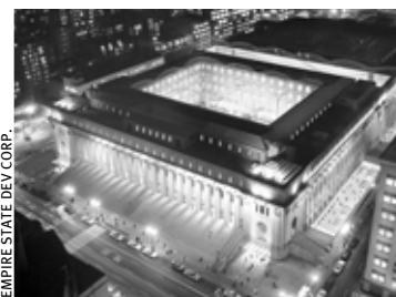
EMPIRE STATE DEV CORP.

hub, which serves 600,000 people each day. Since 2001 T.A., the 34th Street Partnership Business Improvement District and elected officials have asked the DOT to build fenced-in, swipe card accessible, secure bike parking at Penn Station. This fall, T.A. asked the Moynihan Station Development Corporation to include secure bicycle parking in the plans for Moynihan Station.