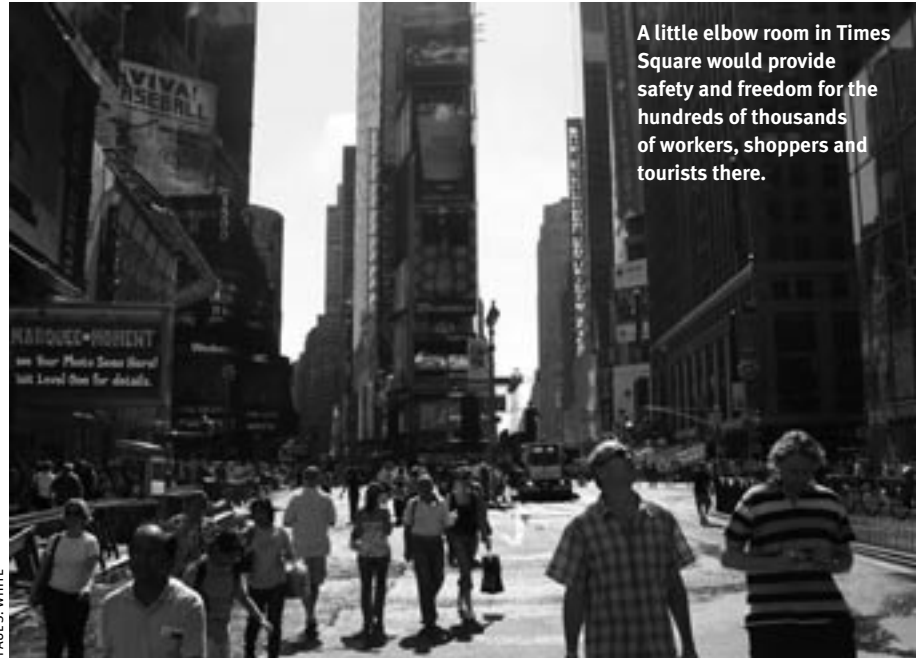
A little elbow room in Times Square would provide safety and freedom for the hundreds of thousands of workers, shoppers and tourists there.

The Times Square business district, one of, if not the most, visited area in New York City, has paid particular attention to the growing number of visitors to their district, with at least half a million people commuting to the Times Square area on any given day and growing. They are one of the few business districts to monitor the number of pedestrians on their sidewalks and streets during the holiday season and recognize the need to move quickly to reallocate space to pedestrians. Since 1980 there has been a 200% increase in people walking through the area with pedestrian counts soaring at key locations. Data from recent years indi-