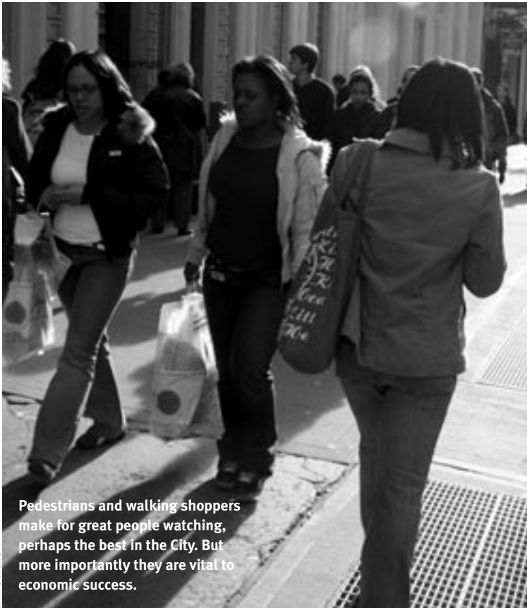
Pedestrians and walking shoppers make for great people watching, perhaps the best in the City. But more importantly they are vital to economic success.