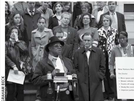
Over 130 groups citywide were represented at City Hall in November to urge Mayor Bloomberg to relieve traffic congestion in their neighborhoods.

I N NOVEMBER, THE CITYWIDE COALITION for Traffic Relief, a partnership of over 130 local organizations, gathered on the steps of City hall to urge Mayor Bloomberg to reduce the amount of motor traffic on city streets and improve alternatives to driving. At the press conference the Coalition unveiled the Charter for New York City Traffic Relief that identifies five steps the City should take to meet these goals: