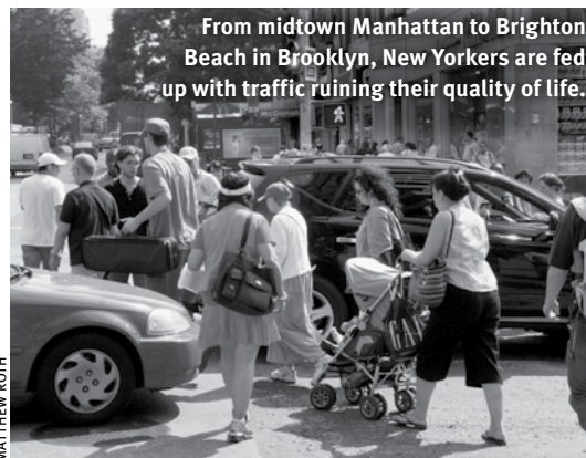
From midtown Manhattan to Brighton Beach in Brooklyn, New Yorkers are fed up with traffic ruining their quality of life.

public citywide data on traffic congestion (the agency's current data collection focuses almost exclusively on Manhattan) and to set targets to reduce driving and increase bicycling, walking and transit use. It would also require the Department of Health to work with the DOT to set goals to reduce traffic-related pollution and crashes.