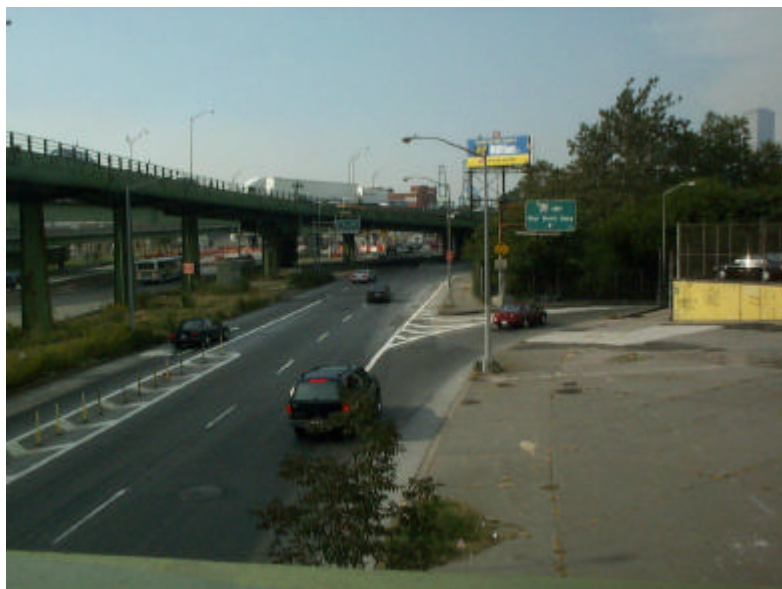
Figure 7.3. New striping and treatment implemented in 2001 restricts weaving on Hamilton Avenue at the BQE.

The final element of the strategy for Hamilton Avenue is to address the safety problems caused by traffic weaving from the Gowanus Expressway across Hamilton Avenue traffic to the on-ramp of the BQE (i.e. jumping the line of traffic on the Gowanus/BQE) or to Hicks Street. Two options were explored, one of which would deny access to both the BQE on-ramp and Hicks Street from the Gowanus Expressway by constructing a physical barrier, and the other which would deny access only to the BQE on-ramp. Discussions with the community indicated that the first and more restrictive option was regarded as too extreme and had the potential for an unintended and adverse consequence of forcing traffic traveling from the Gowanus Expressway to the local area north of Hamilton Avenue into Red Hook. The agreed measure addresses the most severe safety concerns at this intersection but does not protect Hicks Street. This measure has been implemented by NYCDOT.